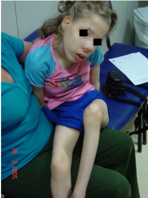
Fig. 1 Physical features of a 14 year-old presenting with severe mental retardation, asthma and recurring upper and lower respiratory infections.

with extensive nasal polyposis, highlighting the management challenges of this unusual case.