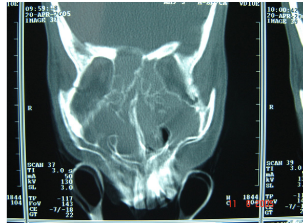
Fig. 3 Coronal scan of computed tomography of the paranasal sinuses showing soft tissue material occupying all sinuses.

due to a growing nasal lesion. The patient was the only child of unrelated parents, born at term by Caesarian section with a birth weight of 2350 g, length of 45 cm and head circumference of 33 cm (all more than 2 S.D. below normal). There was no history of maternal drug or alcohol abuse, X-ray exposure or infection during pregnancy.