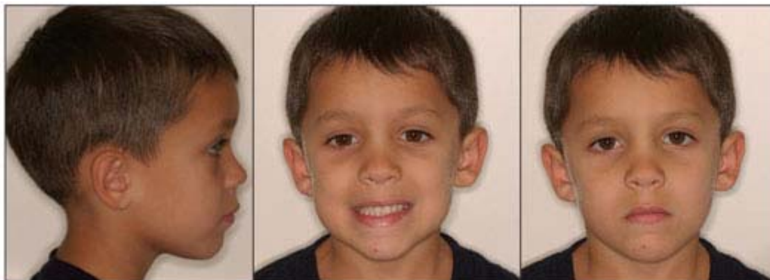
Fig. 6. A boy aged 5 years, 11 months, with adenoid facies.

A 5-year-old boy was seen by a pediatric dentist who understood the problems associated with mouth breathing. The dentist immediately referred him to an ENT specialist, and his tonsils and adenoids were surgically removed; at that point, the child was referred to the author for orthodontic treatment (Fig. 6). The patient was skeletal Class II (mandibular retrognathic), dental Class II, division 1 (Fig. 7). An occlusal view showed minimal crowding; however, the boy had moderately narrow maxillary and mandibular arches with a high palatal vault (Fig. 8).