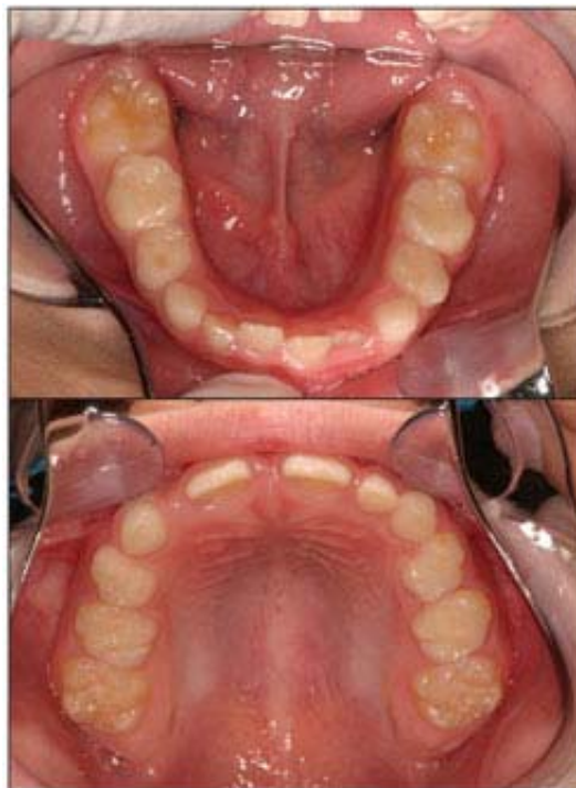
Fig. 12. The maxillary and mandibular arches of the patient in Figure 6, 19 months after the initial insertion.

Even after only one year of expansion therapy, the patient's mother claimed to observe significant improvements in many areas, noting that the patient sleeps better, has a better disposition, is more energetic and willing to participate in activities, stopped bed wetting within seven months after the start of therapy, experienced a significant growth spurt, and had a better appetite and improved speech. In addition, while the patient had been failing most of his subjects, he recently took a standardized achievement test used in the U.S. to assess K–12 student achievement and posted combined reading, language, and math scores in the 99th percentile.