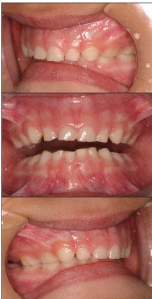
Fig. 7. An intraoral photograph of the patient in Figure 6.