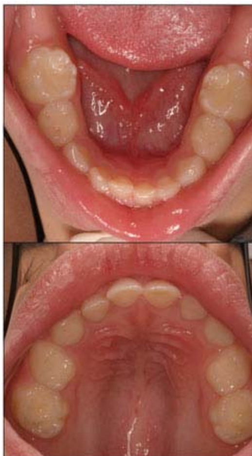
Fig. 8. An occlusal view of the patient in Figure 6. Note that the maxillary and mandibular arches are moderately narrow and the palatal vault is high.

A diagnostic screening revealed that the patient was too young to have developed a long, narrow face; however, he had the typical “adenoid facies” that is indicative of upper airway obstruction/mouth breathing and sleep disorder. In addition, the patient’s height and weight were well below average for his age. In the patient’s health questionnaire, his mother noted that he slept with his mouth open, he tired easily during the day and was easily winded, and he had severe behavior problems in school, throwing temper tantrums to the point where his teacher would have to call on the patient’s older brother to calm him. The patient was unable to concentrate in school and was failing most of his subjects.