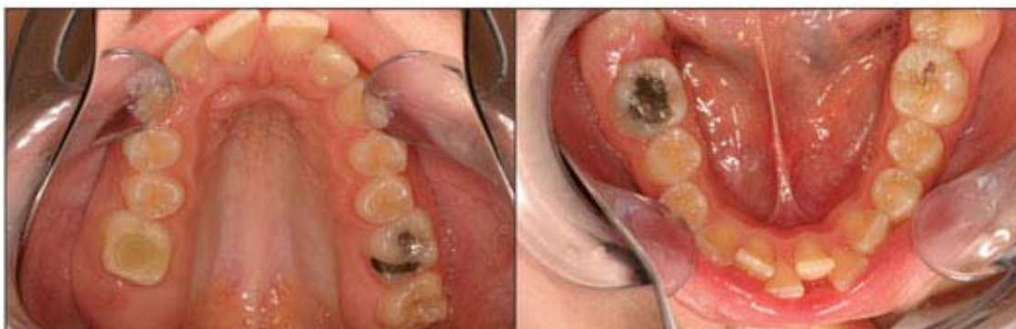
Fig. 4. An example of a child with a narrow palate, high palatal vault, and dental crowding due to mouth breathing.