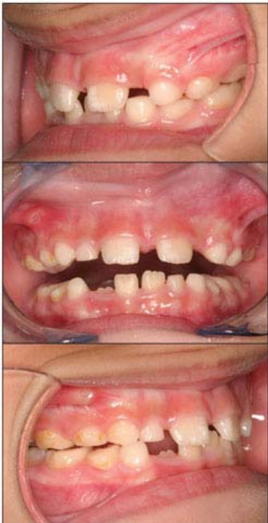
Fig. 11. An intraoral photograph of the patient in Figure 6, taken 19 months after the initial insertion, showing some anterior diastema due to slight overexpansion.