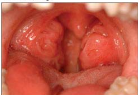
Fig. 5. An example of swollen tonsils, usually found in mouth breathers.

At present, the author believes that the diagnosis and treatment of mouth breathing (and all of its associated medical, social, and behavioral problems) is best managed by using a multidisciplinary approach involving pediatricians, physicians, dentists, and ear-nose-throat (ENT) specialists. Using the clinical observations cited in the table, pediatricians, physicians, and dentists are the primary care providers who can diagnose mouth breathing and sleep disorder problems; these patients should be referred to an ENT specialist for further evaluation and treatment. As previously noted, surgically removing swollen tonsils and adenoids has improved nasal respiration, sleep, behavior problems, and academic performance. Based on the author's experience, many athletically inclined children will actively seek treatment when they understand that it will improve their respiration and enhance their athletic performance.